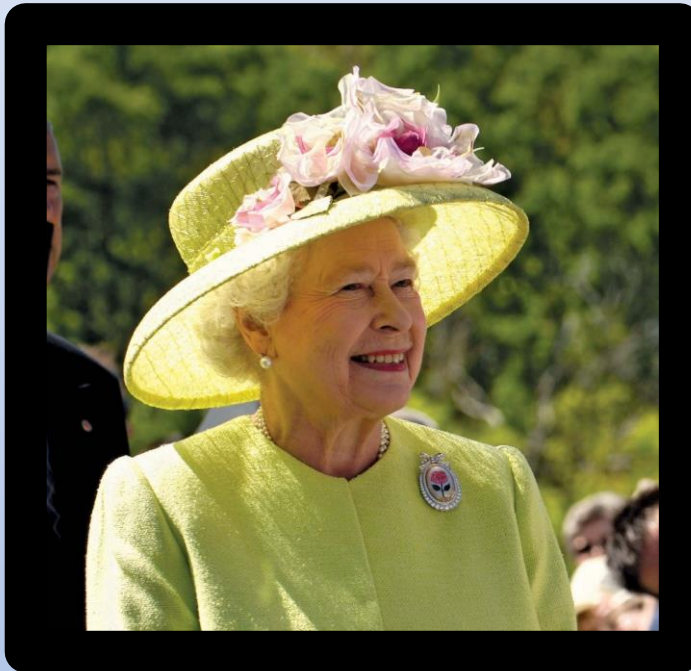
Her Majesty Queen Elizabeth II 1926 - 2022

We woke up today in a world that has lost a great servant to our country, our church and the wider world. We are thankful for her years of unwavering and devoted service. As a school community, we send our prayers and condolences to her family and pray that Her Majesty will rest in peace and rise in glory.