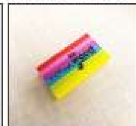
Robinwood Eraser - £1