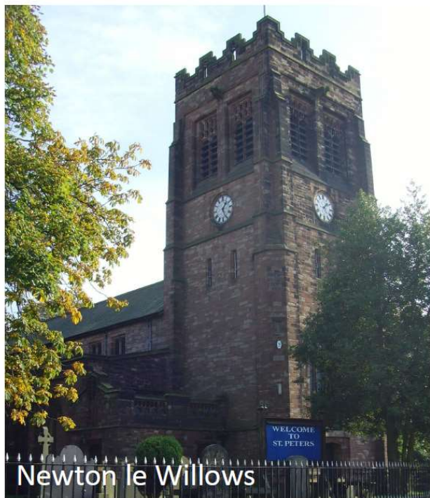
Newton le Willows