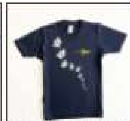
Robinwood T-Shirt - £10