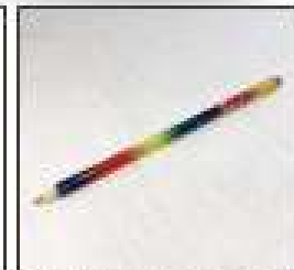
Robinwood Pencil - 60p