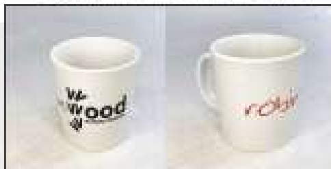
Robinwood Mug - £5