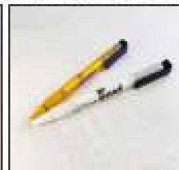
Robinwood Pen - £1.20