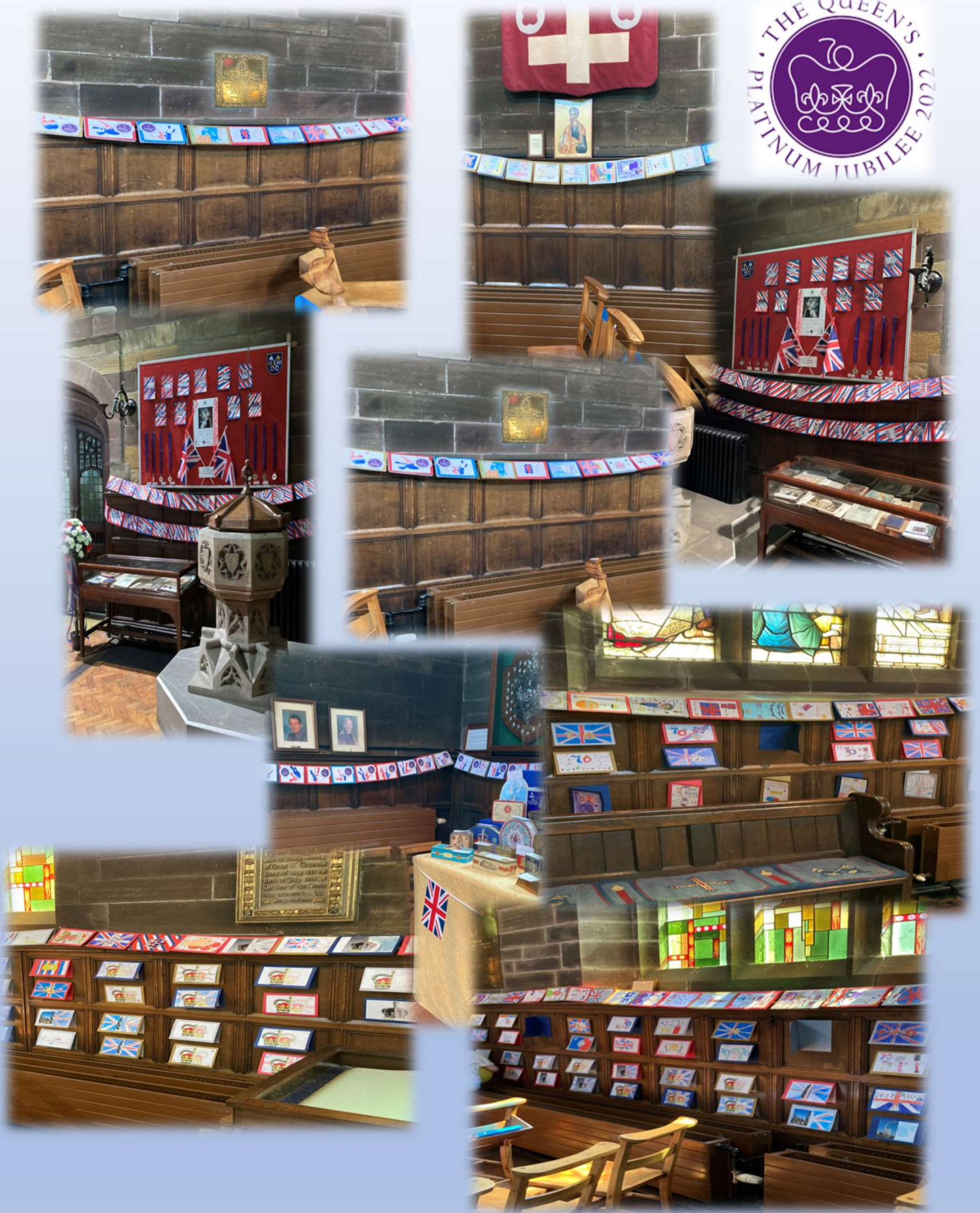
Jubilee cards created by the pupils of St Peter's which were on display in church over the weekend. It was amazing.