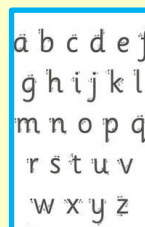
Letter Formation Chart