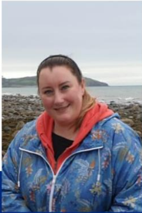
Sam Thorpe Chair