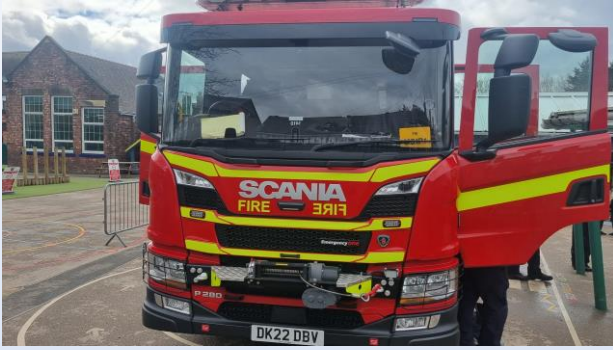
FIRE BRIGADE VISIT