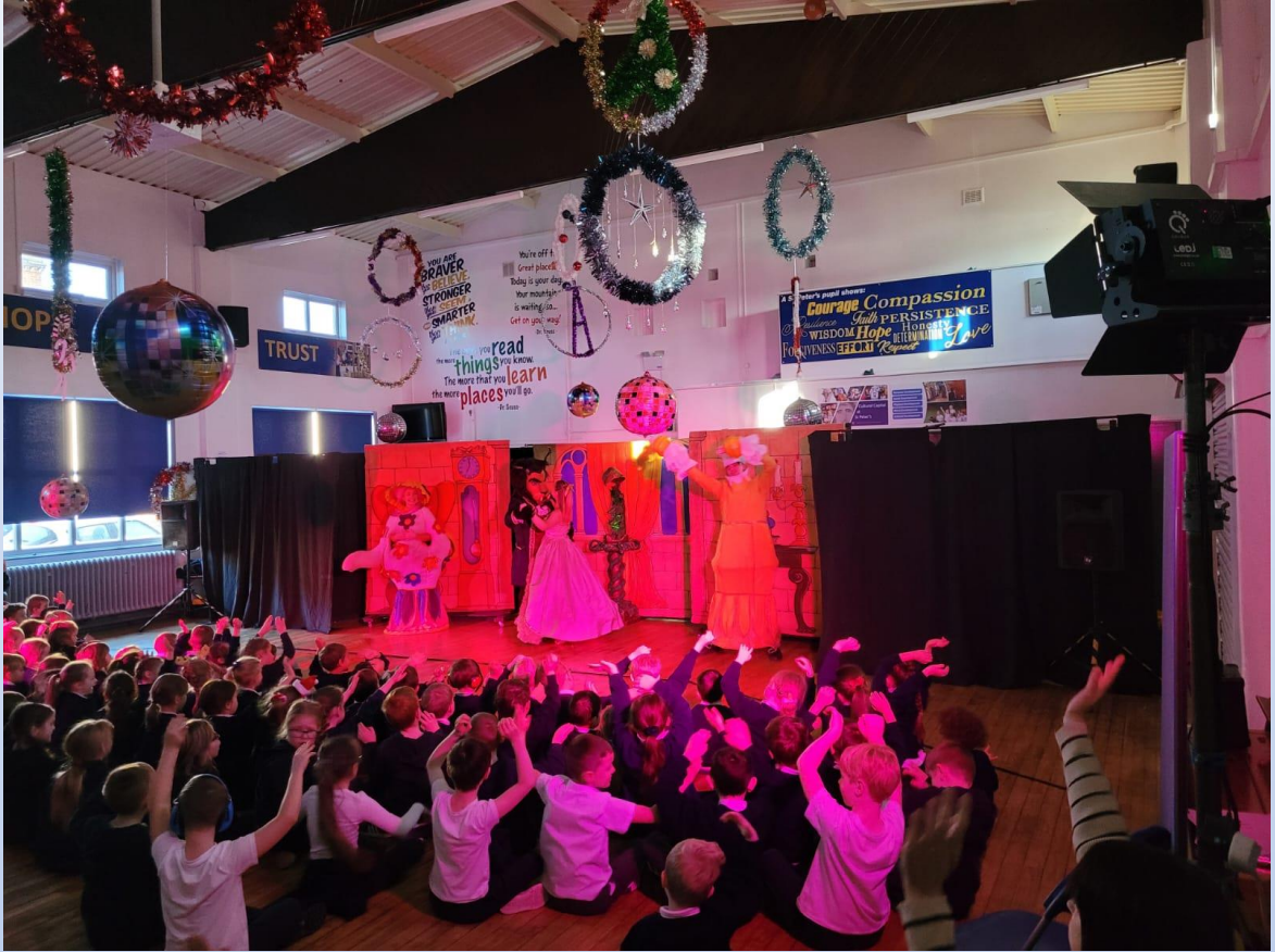
The children thoroughly enjoyed watching the Beauty and the Beast Pantomime on Thursday morning.