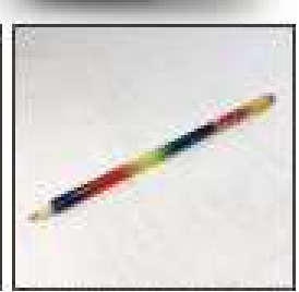
Robinwood Poncii - 60p